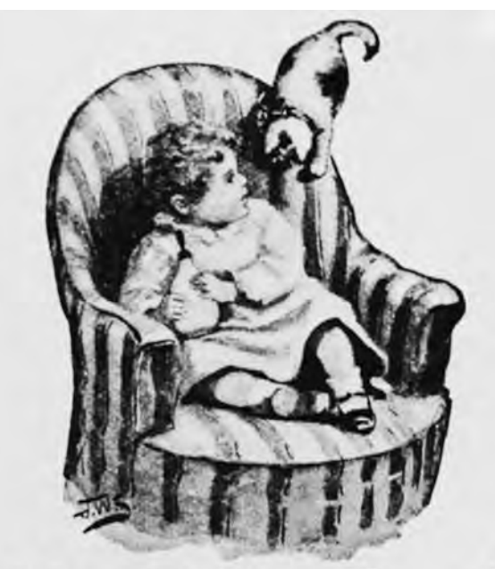
Figure 2-3 An Advertisement for Artificial Infant Milk That Appeared in the Ladies' Home Journal in 1895.

increasingly impelled to give birth and then to feed according to externally generated ideas about how those activities should be accomplished.