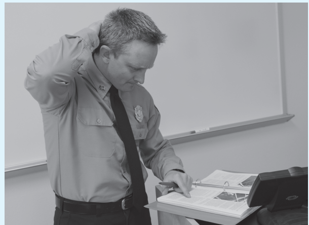
FIGURE 6.1 Attempting to deliver instruction without a lesson plan is like driving in a foreign country without a map. Don't waste valuable class time searching for directions.

Most people without experience in the field of education do not understand the importance of a lesson plan. Attempting to deliver instruction without a lesson plan is like driving in a foreign country without a map ( FIGURE 6.1 ). The goal in both situations is to reach your intended destination. In a lesson plan, the learning objectives are the intended destination. Without a map (the lesson plan), you most likely will not reach the destination. Also, without a lesson plan that contains learning objectives, you may not even know what the destination for the class is. In other words, if you do not have