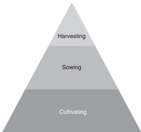
FIGURE 5-1 Cultivating, sowing, harvesting.

Reproduced from International Health Services (IHS). (2015). The Saline Process trainer's manual . Southeastern, PA: Author.